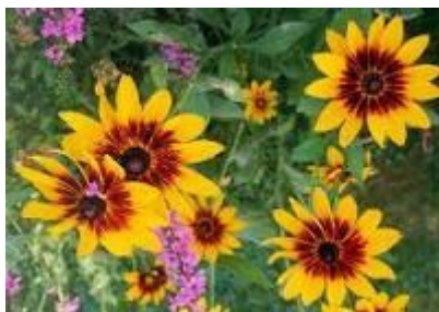
Figure 1 Example of a High definition image

Figure legends (captions) should be 12 point normal times new roman with a single space and centered. Legends should be preceded by the appropriate label, for example "Figure 1" and "Figure 2". Figures must be numbered using numerals. Legends of a single line must be centered whereas multi-line captions must be justified. Captions with figure numbers must be placed after (below) their associated figures, as shown in Figure 1.